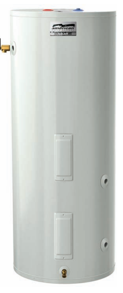
SSX62-80H-045S and SSX62-119H-045S

Complies with current editions of: UL Standard for Household Electric Storage Tank Water Heaters, UL 174; Packaged Solar Domestic Hot Water Systems (Liquid-to-Liquid Heat Transfer) For All-Season Use, F379.1-09; Packaged Solar Domestic Hot Water Systems for Seasonal Use, F379.2-09 and ICC Codes and HUD Standards